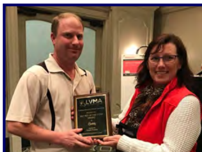
Pet of the Year Buddy